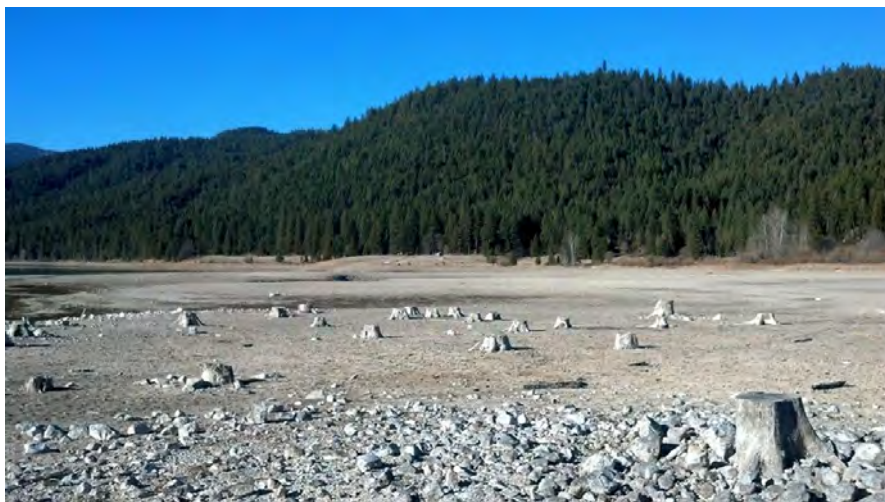
Lake Siskiyou. Rocks and stumps like these lurk a few feet below the surface of the lake where the racers would have entered the lake for the swim.